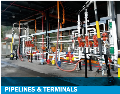
PIPELINES & TERMINALS