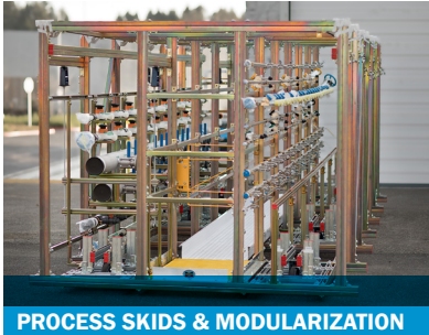
PROCESS SKIDS & MODULARIZATION